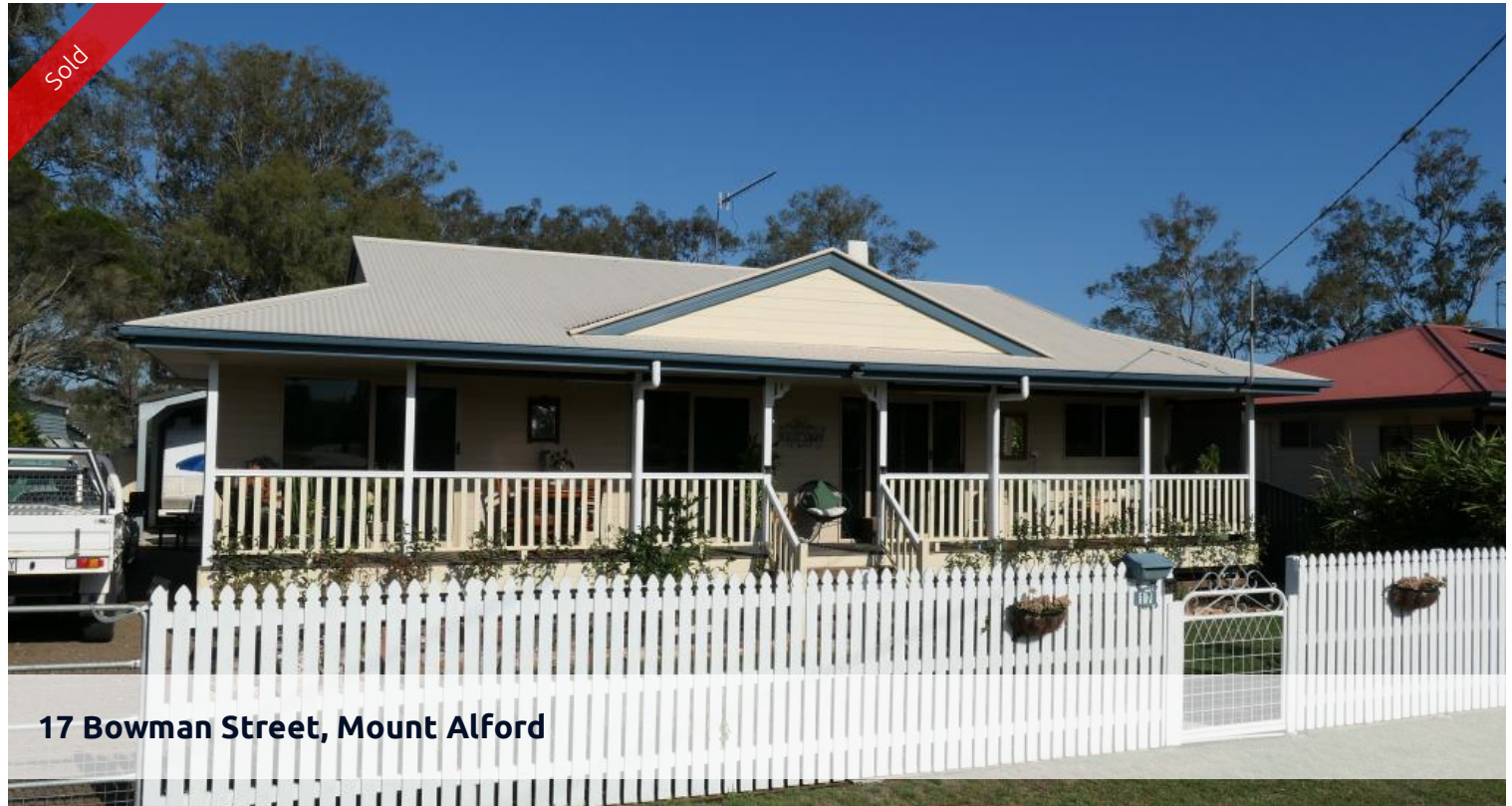
17 Bowman Street, Mount Alford