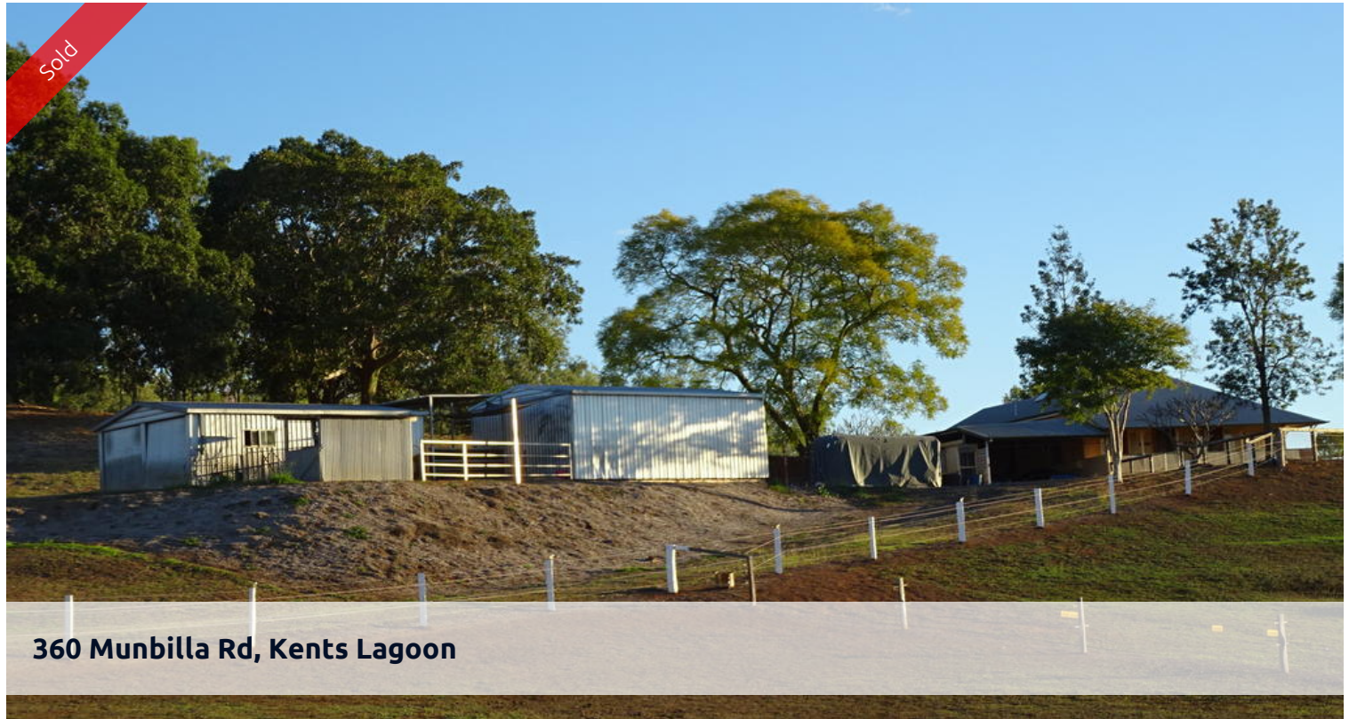
360 Munbilla Rd, Kents Lagoon