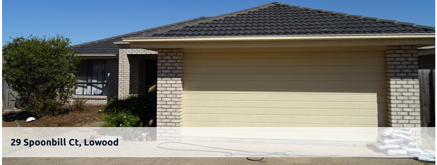
29 Spoonbill Ct, Lowood