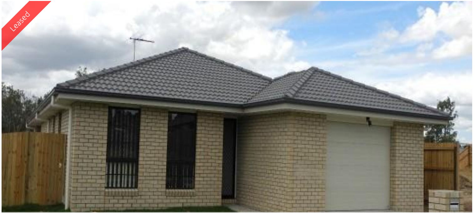
House 36, 12 Walnut Cres, Lowood