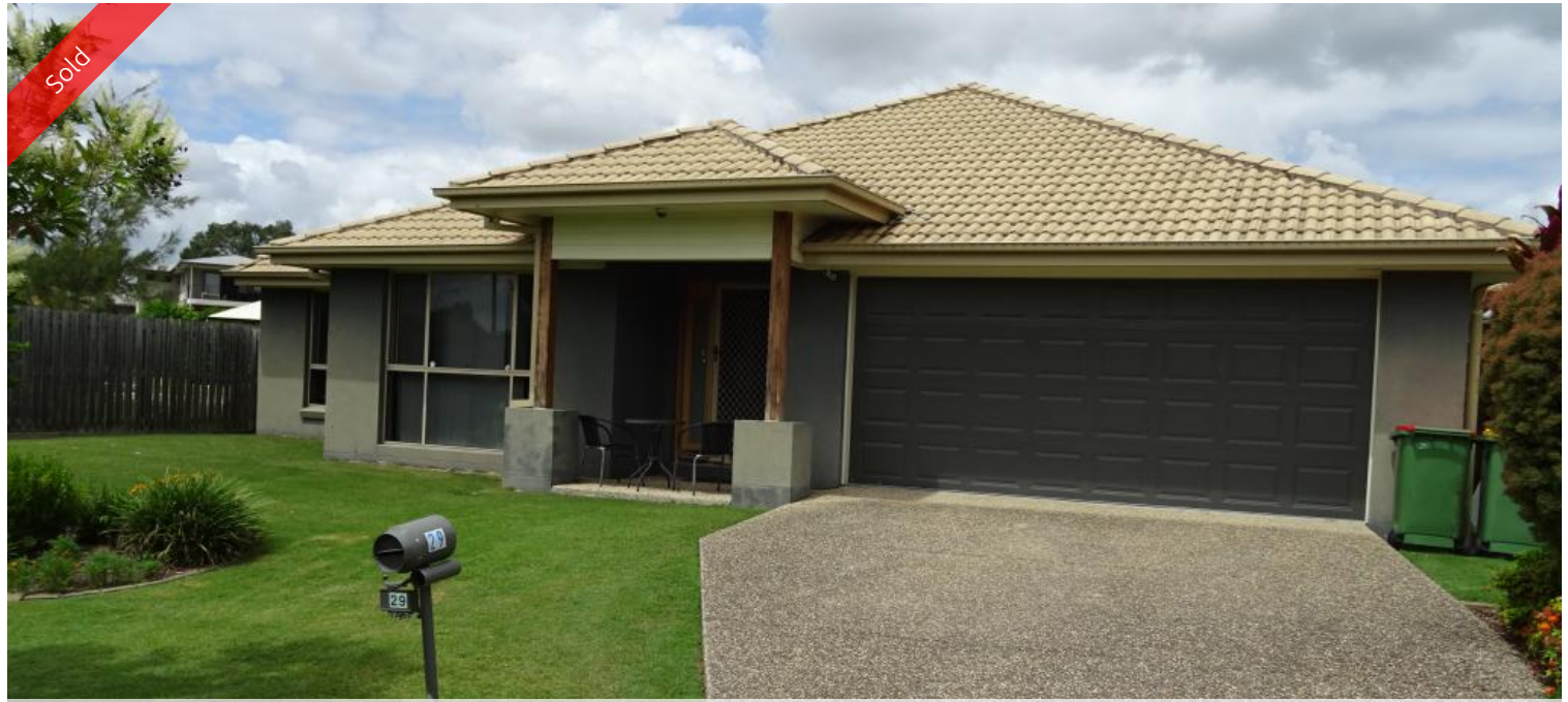
29 Biella Ct, Leichhardt