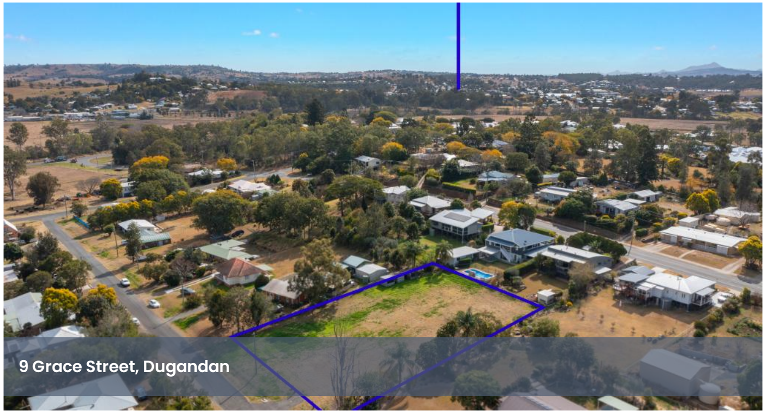
9 Grace Street, Dugandan